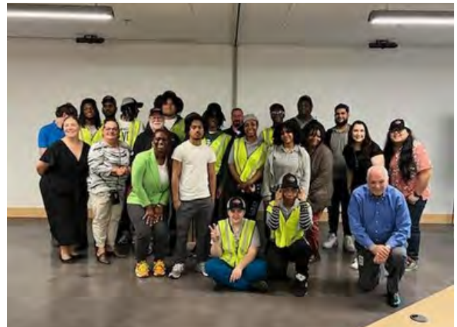
Orleans Technical College

Students from Cristo Rey Philadelphia High School stopped by to present as part of their work-study program. Since 2014 we've been a partner and absolutely love having the students in to share their work and learn more about Acme!