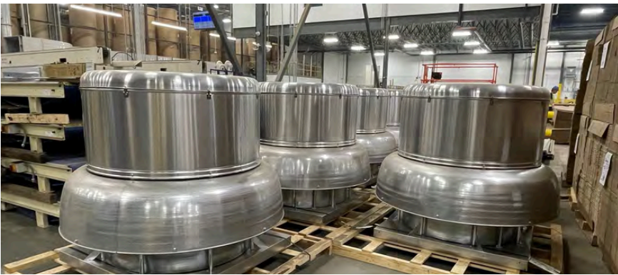
New HVAC System