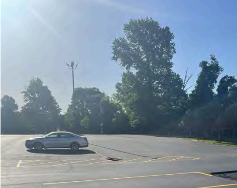
Parking Lot Makeover

Acme continues its investments in new equipment to increase productivity as well as continuously improving our facilities for the Acme Team!