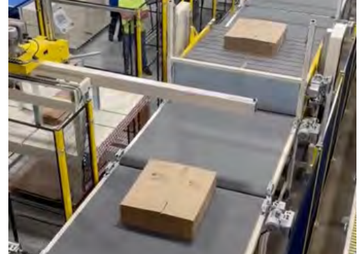
New DRA Palletizer