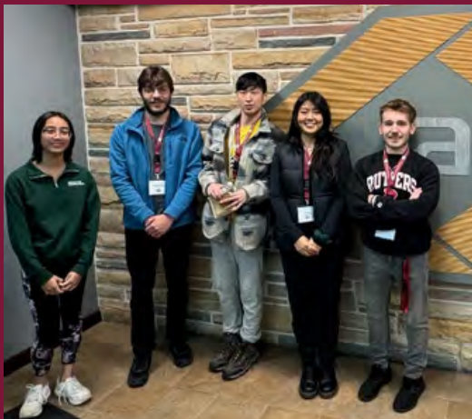
Rutgers School of Engineering